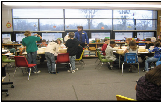
—McLean Science Lab

To learn more about McLean, visit us at http://mclean.usd259.org