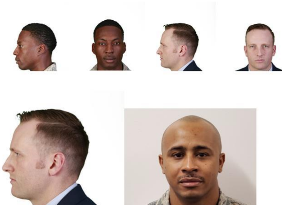
FIGURE 3.1. Male Hair Standards Examples.

3.1.2. Hair-Male. Tapered appearance on both sides and the back of the head, both with and without headgear. A tapered appearance is one that when viewed from any angle outlines the member's hair so that it conforms to the shape of the head, curving inward to the natural termination point without eccentric directional flow, twists or spiking. A block-cut is permitted with tapered appearance. Hair will not exceed 2 ½ inches in bulk , regardless of length and ¼ inch at natural termination point; allowing only closely cut or shaved hair on the back of the neck to touch the collar. Hair will not protrude under the front band of headgear. Cleanly shaven heads, military high-and-tight or flattop cuts are authorized. Prohibited examples (not all- inclusive) are Mohawk, mullet, cornrows, dreadlocks or etched shapes and/or design. Cadets may have one (cut, clipped or shaved) front to back, straight-line part, not slanted or curved, on either side of their head, above the temple. Part will not exceed 4 inches length or ¼ inch width. Men are not authorized hair extensions. See figure 3.1 for graphic examples of appropriate sideburns, mustache and male hair standards.